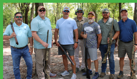
Division 2 Team participates on the course.