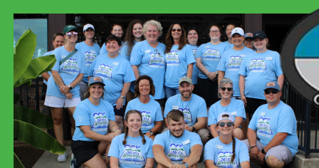
CCK Staff at the Nashville Gun Club